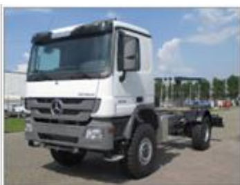
1 x Mercedes-Benz ACTROS 2036-A