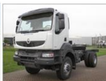
6 x Renault KERAX 330.21 HD