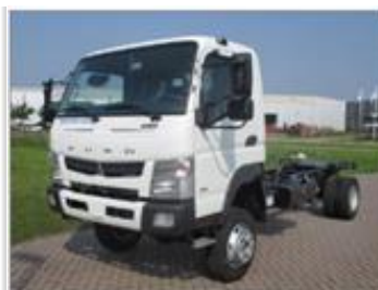
4 x Fuso-Mitsubishi Canter 6C18