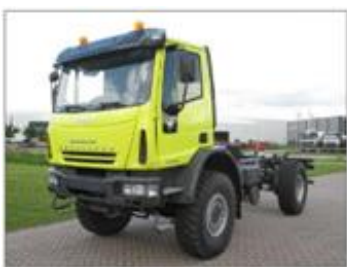
1 x Iveco EUROCARGO ML140E24W