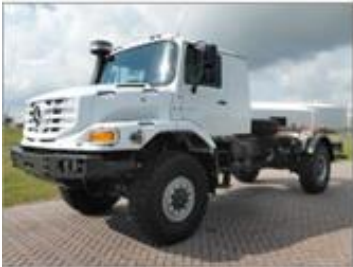
1 x Mercedes-Benz ZETROS 1833-A